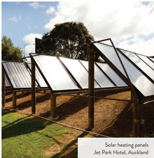
Solar heating panels Jet Park Hotel, Auckland

Some of our responsible tourism initiatives include: Redevelopment and regeneration of wetland areas, and planting of native species in grounds, installation of flow restrictors to reduce both gas and water usage, installation of solar panel farm providing energy for heating water, removal of plastic straws, plastic bin liners and plastic containers, installation of an EV charger, eco-friendly amenity range + more!