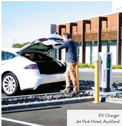
EV Charger Jet Park Hotel, Auckland