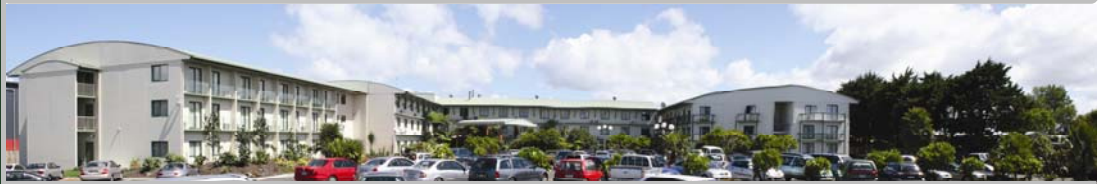
South Wing extension 2008 (left), Cullinan Wing 2004 (right), Original Wing 1998 (centre & left).

We hope you enjoy your stay with us! There are a range of room styles that you can choose from at Jet Park Hotel, each caters to the slightly different needs of our leisure and corporate traveller, with varying bedding configurations and room sizes. All our rooms are tastefully furnished and include a fridge, mini-bar, tea/coffee making facility, safes,