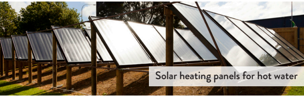
Solar heating panels for hot water