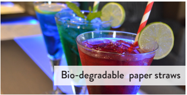
Bio-degradable paper straws